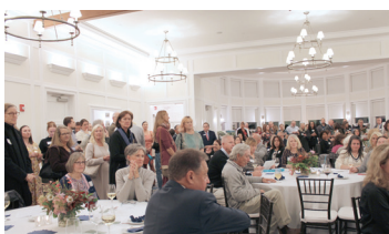
A Full House of Friends & Supporters