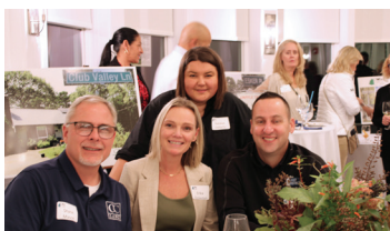
Clancy Construction Crew