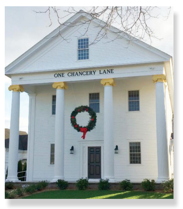
The Trust repurposed a blighted property in the heart of Falmouth's popular downtown area and restored its value to the community.