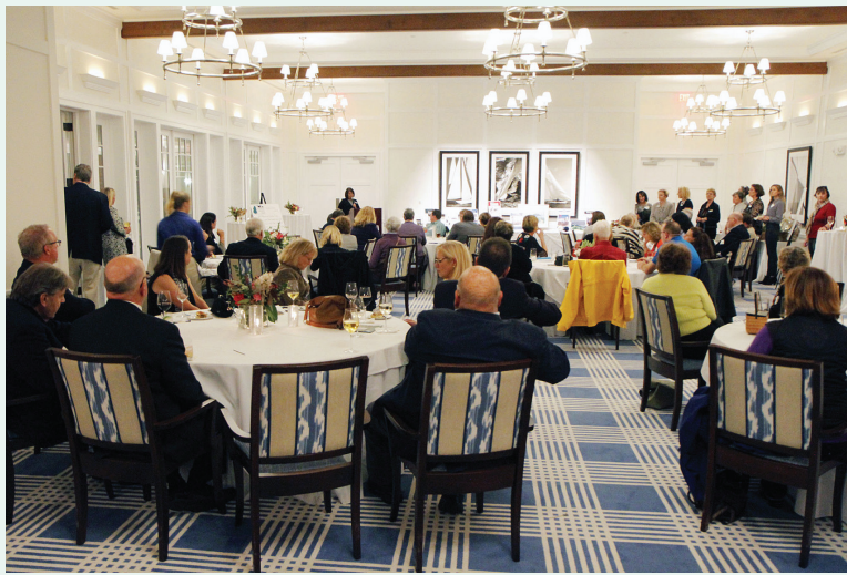
2017 Annual Meeting held at Woods Hole Golf Club